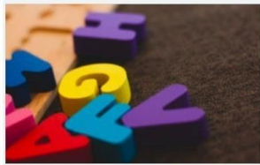
Speech and Language.